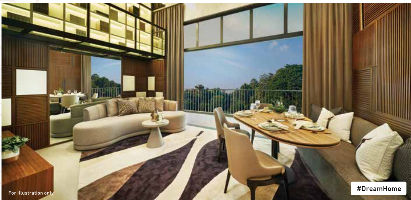
Efficient living room layout for family bonding