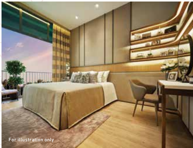
A stylish sanctuary for restful slumber

Each home within Piermont Grand is inspired for stylish living. Furnished with splendid details like quality fittings from GROHE, branded kitchen appliances from Teka, and the award-winning Haiku fan, your apartment truly brings luxury living to the next level. To suit your aesthetics, you can select either the Earthy Lux or Cool Breeze colour scheme as the choice for your finishes. For selected units, a walk-in wardrobe and a kitchen island are included through thoughtful space planning.