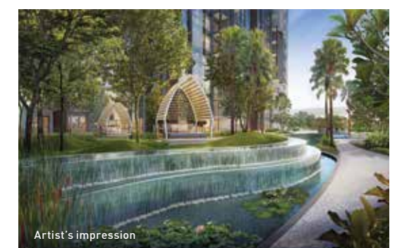
Rolling Lawn and Cabanas