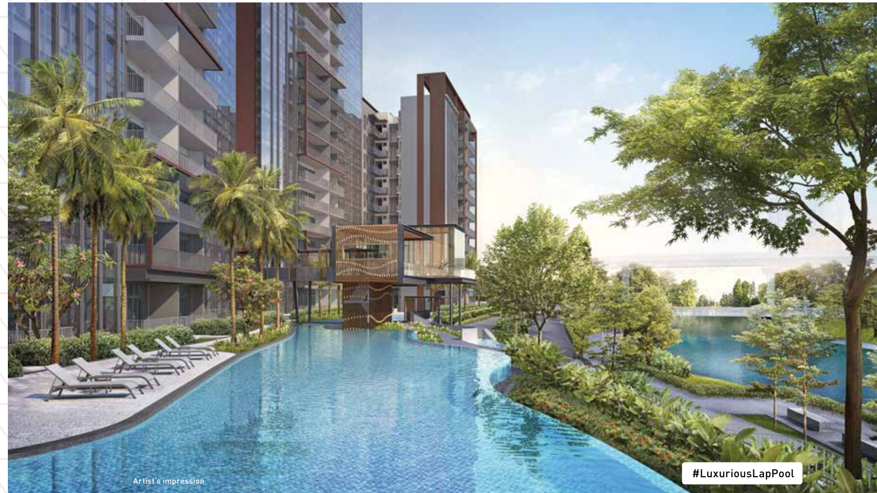
50m Lap Pool

Built upon the idea of a vantage point elevated high above, Piermont Grand is designed for those looking to experience a new level of luxury while moving forward in life with your loved ones. Through the array of sports, relaxation, and entertainment facilities in each of the four landscape zones, you can certainly enjoy greater heights of living as you embrace the future.